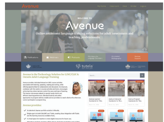
Screen from avenue.ca.

Instructors also have support from an expert personal mentor as they progress through the training.